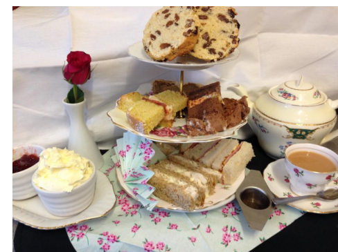
Afternoon Tea for Two

By the 15th of September to be in with the chance of winning.